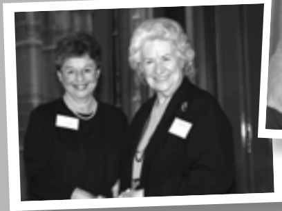
Grant Awards Event