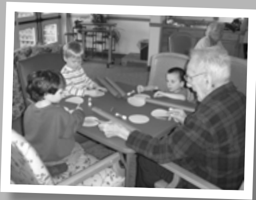
Martha and Mary Intergenerational Program Participants