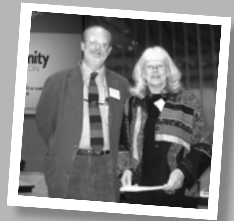
Grant Awards Event