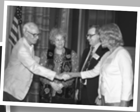
Grant Awards Event