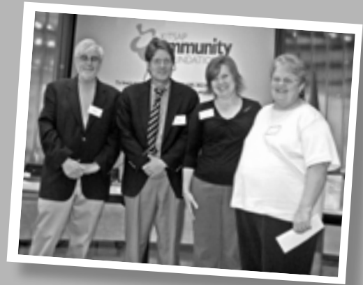
Grant Awards Event