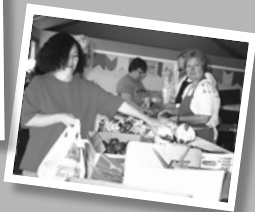
God's Kitchen Helpers