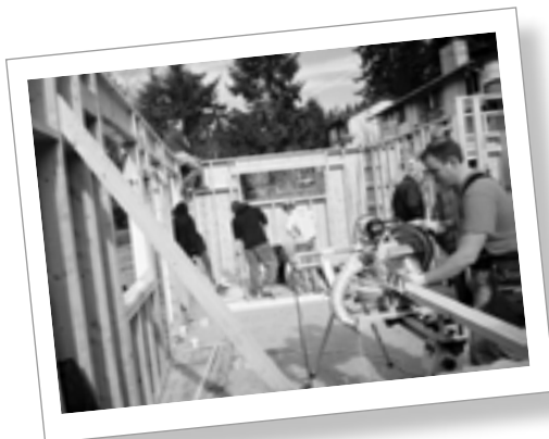
Habitat for Humanity