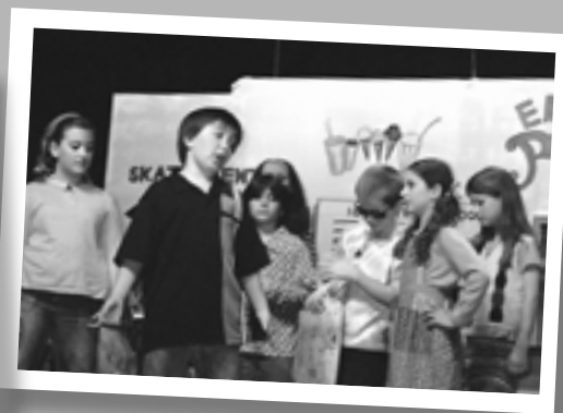
Kitsap Children's Musical Theatre (4th-5th graders)