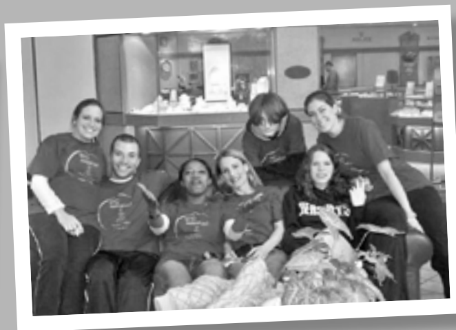
Bremerton Housing Authority – Westpark Youth Mentoring Program Walkers

are now able to experience what Martha & Mary residents in Poulsbo have long known—the welcome energy and smiles of exuberant youth.