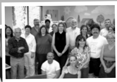
Washington CASH Micro-Lenders