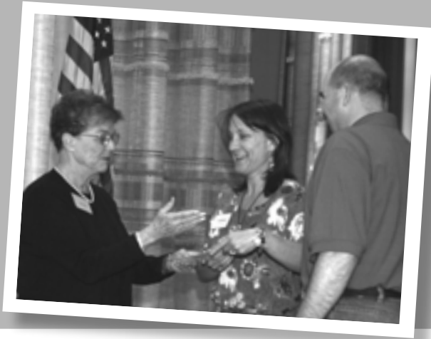
Kitsap Children's Musical Theatre