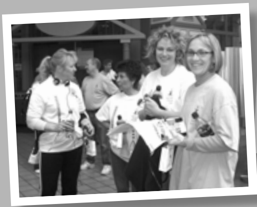
Youth Mentor Walk at the Kitsap Mall