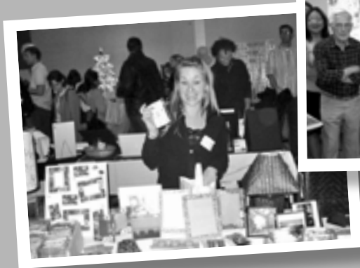
Washington CASH Entrepreneur