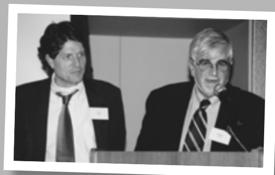
2005 Giving Business Award: Kitsap Sun