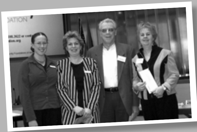
Grant Awards Event